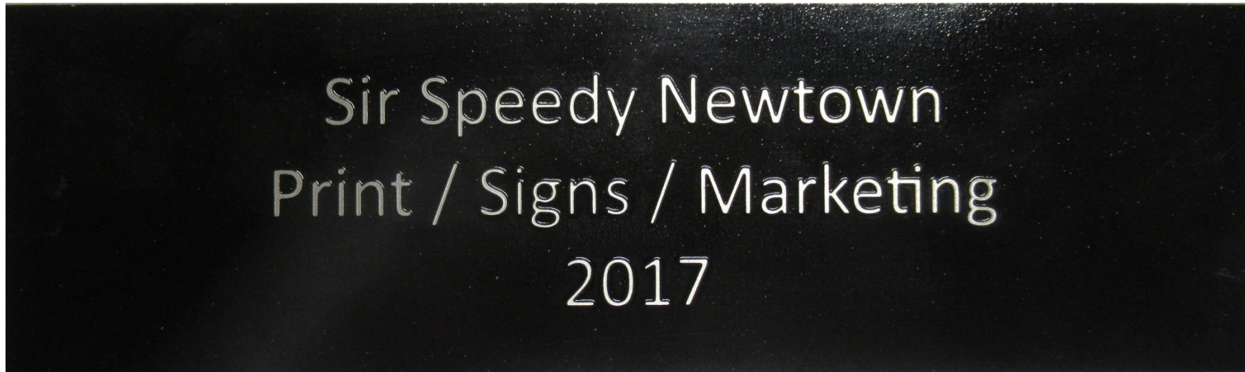
Image of Cast Aluminum Plaque